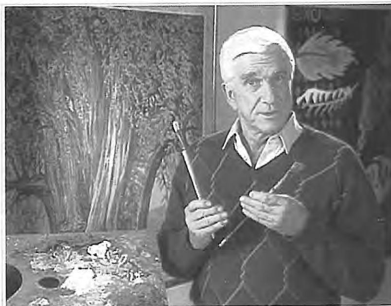
Leslie Nielsen, narrator of the Foundation's "Investing in Art" series of videos.