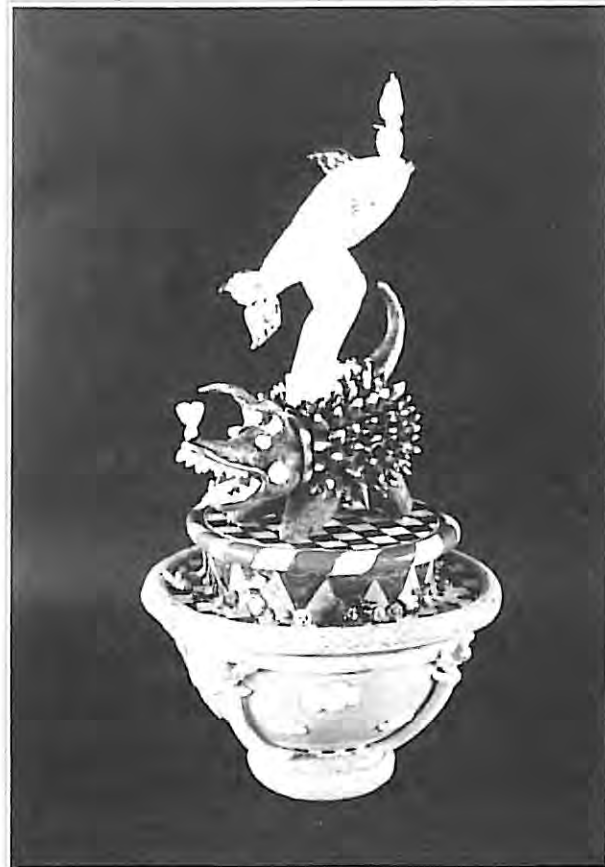
"Neo-classical, Mexicana, Victoriana", 1992, ceramic by Kirsten Abrahamson.

Selected artworks in the collection were borrowed by major galleries in the province and across the country for exhibitions. In addition, artworks were loaned to government offices and non-profit organizations for public viewing. Close to 2,420 artworks were displayed in more than 268 venues under this program (Appendix II).