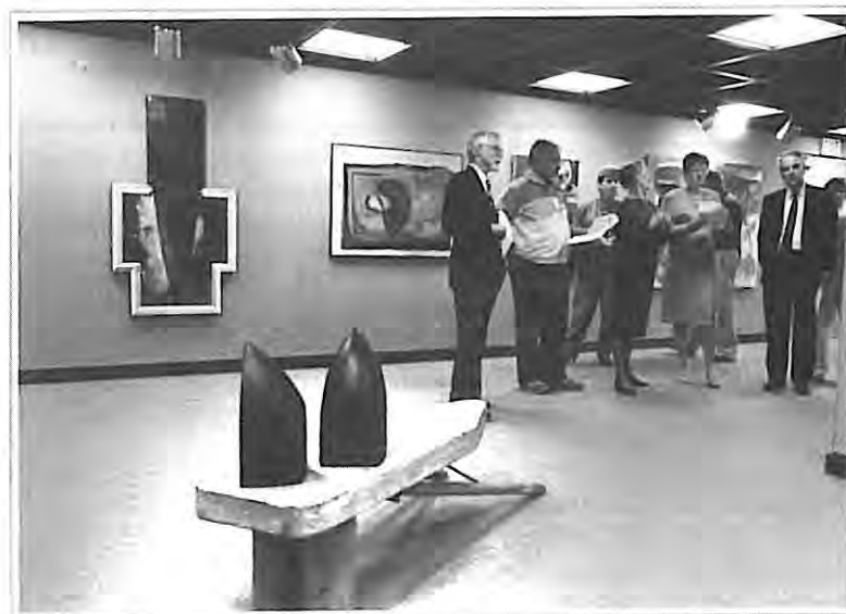
Foundation Board and Jury review artwork for the 1992 Art Acquisition Through Slide Submission Project.

These artworks were welcome additions to the collection; some of them could not have been purchased by the Foundation due to the policy of purchasing only work by artists who are or were Alberta residents. These works greatly enhance the collection.