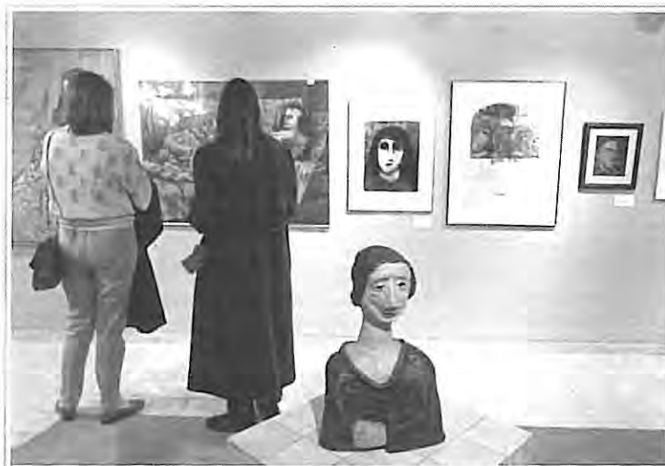
"Human Images" exhibition at McMullen Gallery, Edmonton.

Art Gallery of Windsor, Ontario, "Canadian Art and Mexico" Constitution Square, Ottawa, "Canada's First People: A Celebration of Contemporary Native Visual Arts" First Canadian Place, Toronto, "Canada's First People: A Celebration of Contemporary Native Visual Arts" Founder's Square, Halifax, "Canada's First People: A Celebration of Contemporary Native Visual Arts" Kelowna Art Gallery, "Come Walk With Me: A Luke Lindoe Retrospective" Musee du Quebec, Quebec City, "The Crisis of Abstraction" National Gallery of Canada, Ottawa, "The Crisis of Abstraction" Plaza Alexis Neon, Montreal, "Canada's First People: A Celebration of Contemporary Native Visual Arts" Sinclair Centre, Vancouver, "Canada's First People: A Celebration of Contemporary Native Visual Arts" The Gallery/Stratford, Ontario, "Canadian Art and Mexico" Thunder Bay Art Gallery, "The Art of Alex Janvier: His First Thirty Years" Winnipeg Art Gallery, "Achieving the Modern: Canadian Abstract Painting and Design of the 1950s" Winnipeg Art Gallery, "Canada's First People: A Celebration of Contemporary Native Visual Arts" W.K.P. Kennedy Gallery, North Bay, Ontario, "Canadian Art and Mexico"