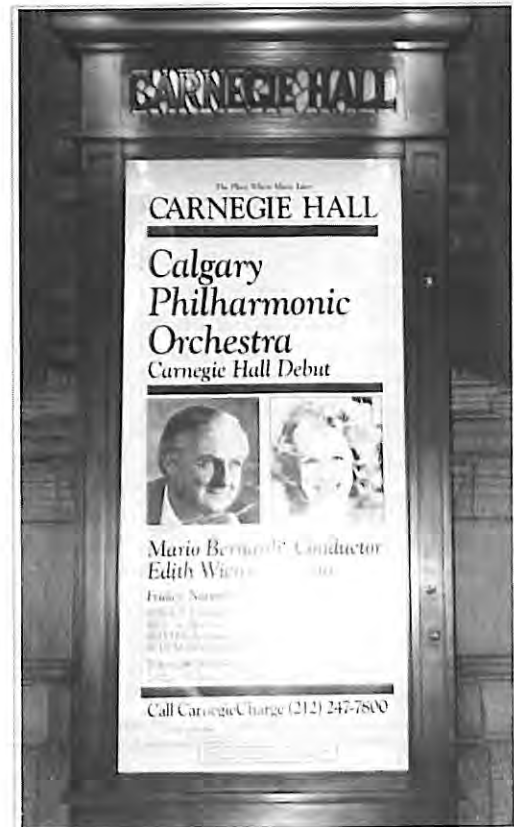
Promotional material for the New York performance of the Calgary Philharmonic Orchestra.